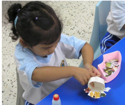
Another three year old engrossed working on her craft independently.