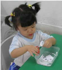
Learning how to count through fun games and activities.