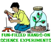
FUN-FILLED HANDS-ON SCIENCE EXPERIMENTS

No child left behind policy. Every child will improve in their learning with us. Our many top students in Primary Schools prove it.