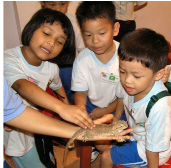
Educational excursions for real life exposure